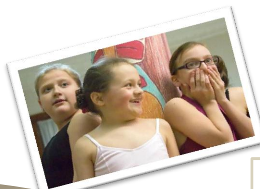
Rehearsal